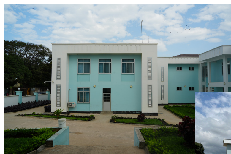
Mazigira ya nje outdoor areas

Where do people get bitten by mosquitoes in the hospitals