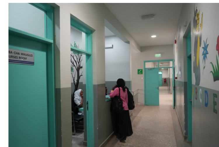
Sehemu ya wauguzi (Nurse station)