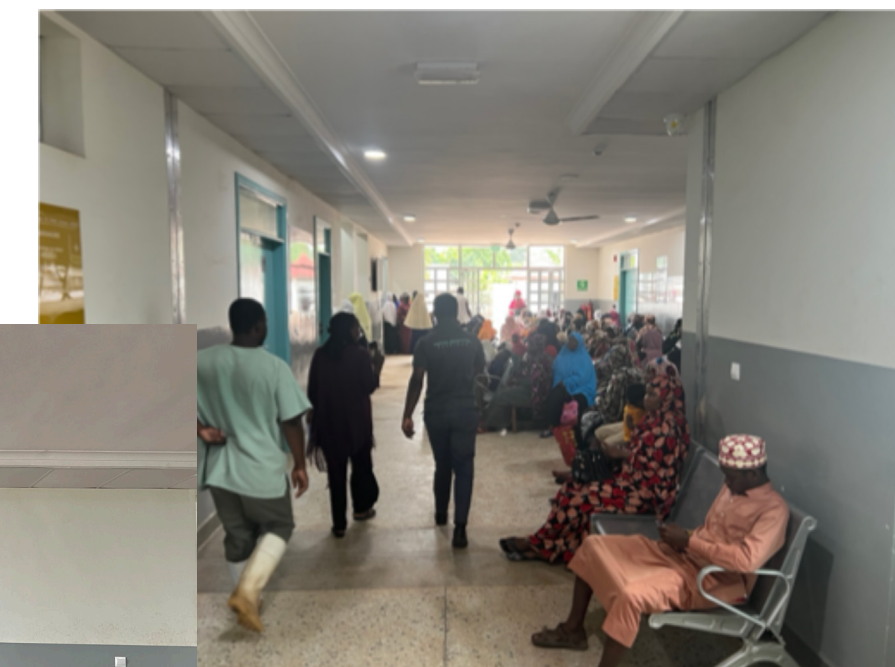
Sehemu ya kusubiria (Waiting area)